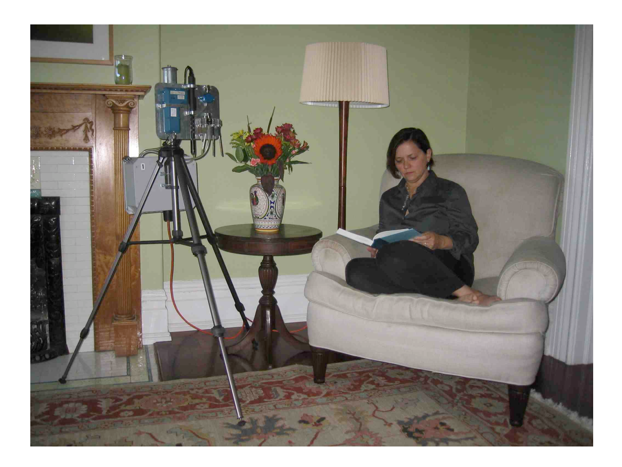
Figure 1. Quiet indoor air sampler for formaldehyde, VOC's, PM<sub>2.5</sub>, NO<sub>2</sub>, CO, CO<sub>2</sub>, temperature, and relative humidity, typically installed in a home living/dining room area for a 22 - 26 hour sampling period.