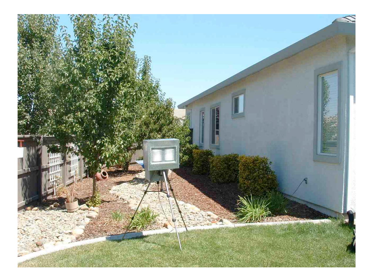
Figure 2. Outdoor air sampler for formaldehyde, VOC's, PM<sub>2.5</sub>, NO<sub>2</sub>, CO, CO<sub>2</sub>, temperature, and relative humidity, with outdoor radiation/rain shield.