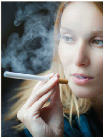
PHOTO 1: E-cigarettes do not produce a vapor (gas), but rather a dense visible aerosol of liquid sub-micron droplets consisting of glycols, nicotine, and other chemicals, some of which are carcinogenic (e.g., formaldehyde, metals, nitrosamines).

samplers from an e-cigarette attached to a mechanical smoking machine. For our exposure analyses we included seven of the 11 chemicals studied by Goniewicz